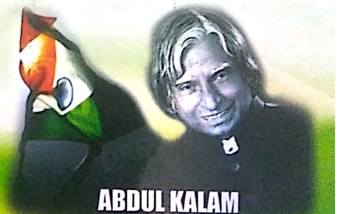
ABDUL KALAM DIES IN HARNESS

ADJUSTMENT & SELF-CONCEPT ACADEMIC ACHIEVEMENT